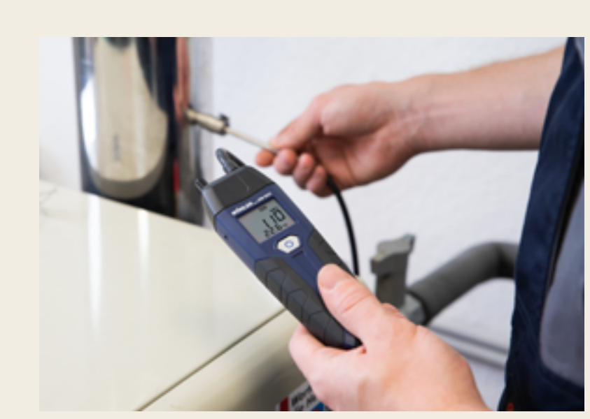
With the Wöhler DM 602, you can work both quickly and precisely when taking settings from the burner and when measuring the draught in the flue gas pipe.